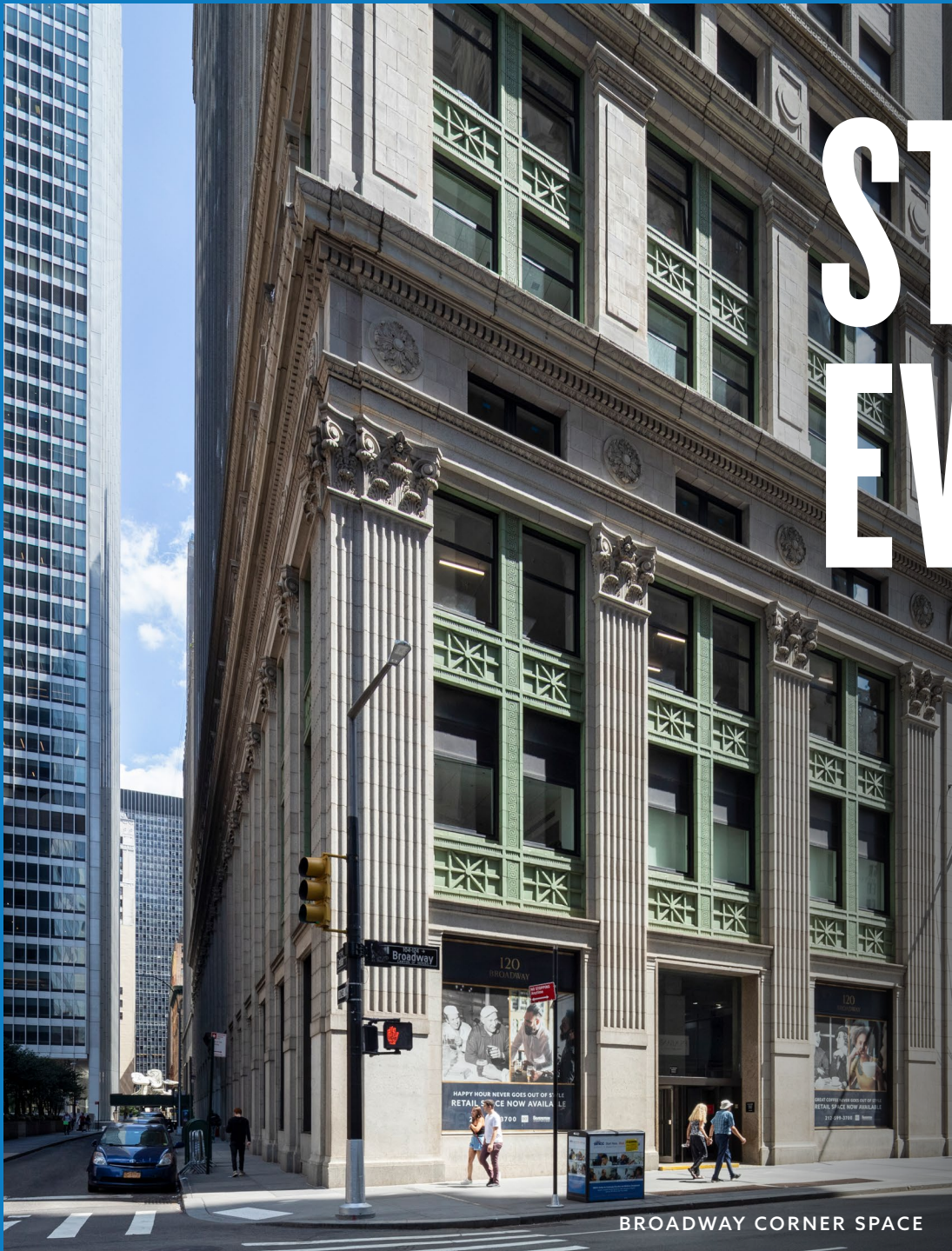
BROADWAY CORNER SPACE

120 Broadway is a 1.9 million square foot office building that takes up a full city block in the heart of Downtown's vibrant and energized Financial District.